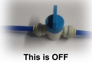
This is OFF