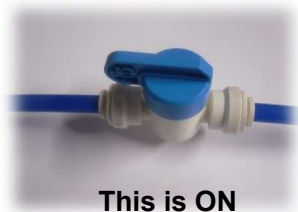
This is ON

Please make sure the water supply to the machine is turned on. To check this, look at the back of the machine for a small part on the tube which we call a "smurf" it has a blue handle and a white body.